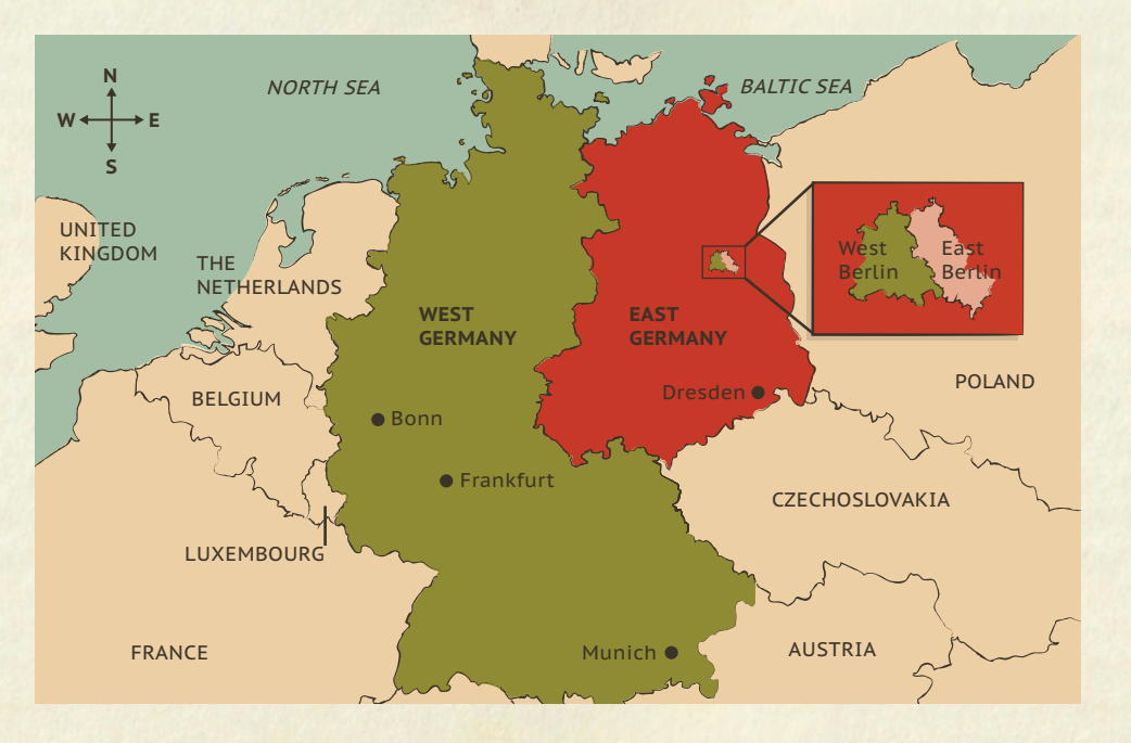
From 1949–1989, West Berlin was an island of freedom surrounded by Soviet rule.

Many of the East German people didn't want to live under Soviet rule, and they began to escape to freedom in the West. To the rest of the world, they were refugees, but the Soviet Union called them defectors. Between 1949 and 1959, over two million people left East Germany. The easiest route was through East Berlin into West Berlin because thousands of people crossed the city's border to shop and work each day. On just one day, in early August 1961, around 2,400 East Germans travelled into West Berlin and never came back. The East German leaders were determined to put a stop to this, and so they built the Berlin Wall.